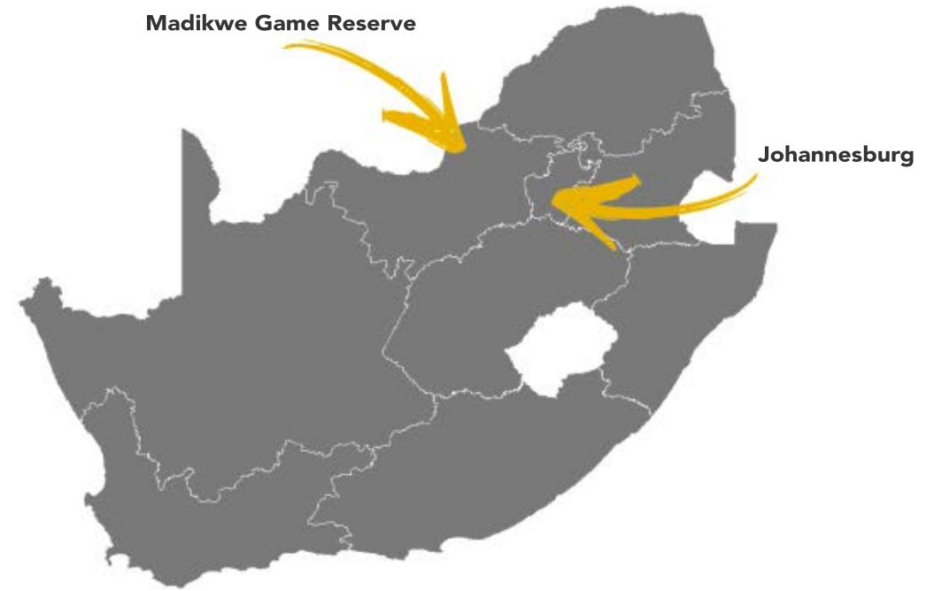
Madikwe Game Reserve

Now, the 75 000 hectares of land are considered home to the big five and other elusive species of animals. The Madikwe Reserve is a hidden gem, as it is not well known to the public. It is the fifth largest reserve in South Africa.